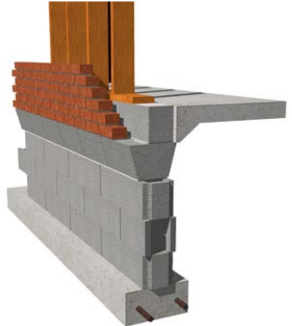
4" Brick Ledge with Slab Ledge