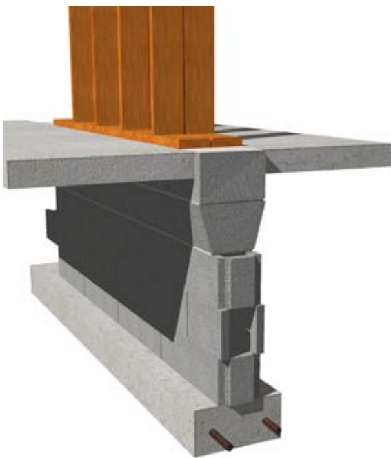
Demising Wall Section