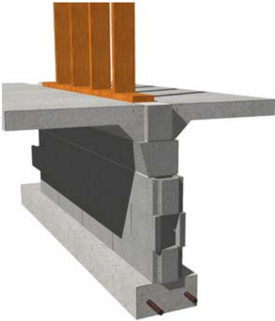
With Two Slab Ledges