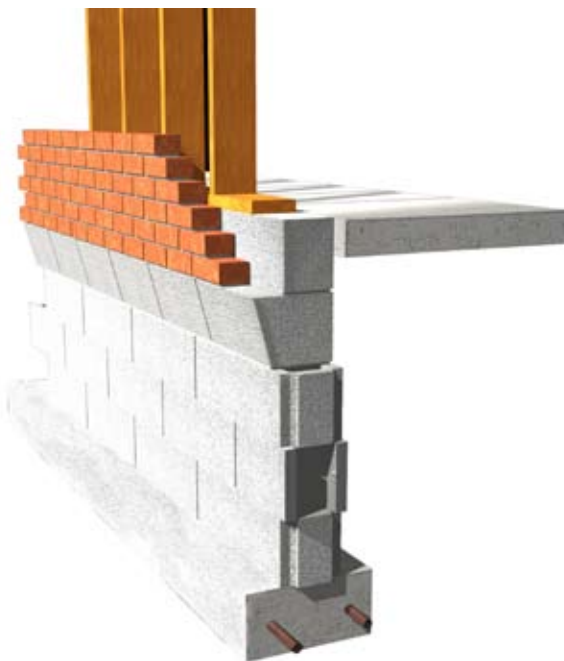
4" Brick Ledge Section